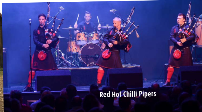
Red Hot Chilli Pipers