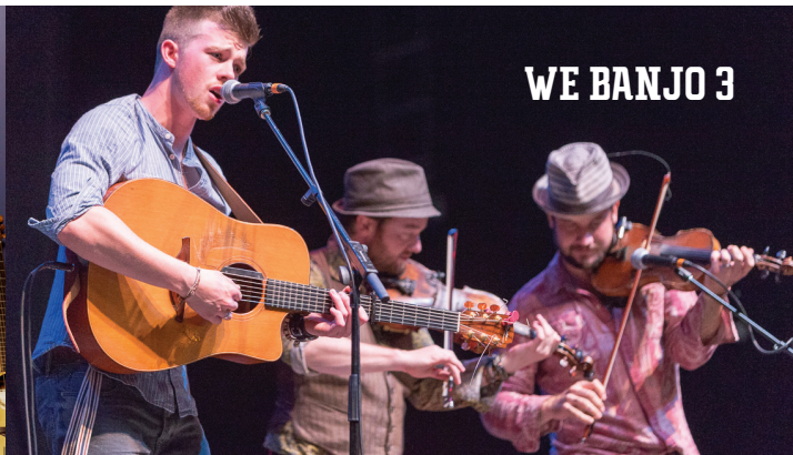
WE BANJO 3